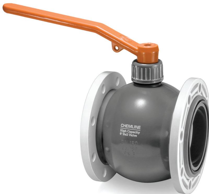
4" & 6" Sizes