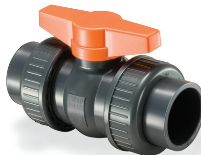
1/2" to 2" Sizes

Chemline SL Series Cavity Free Ball Valves are molded-in-place full port 1/2" to 6", available in PVC and PP with a polyethylene ball. The 6" size is a full port alternative to a 4" ball valve with ends increased to 6".